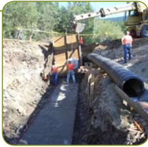
Lomakatsi Restoration Project

How to plan for a restoration economy during a recession? Our cities and counties must act as if clean water and healthy forests equal prosperity for our region. Local governments can invite restoration by supporting large-scale dam removal, lobbying for state and federal restoration dollars and helping local businesses re-tool for restoration jobs. Incentives for renewable energy could also help the Klamath - blessed with sun, wind and geothermal energy - become a leader in this sector.