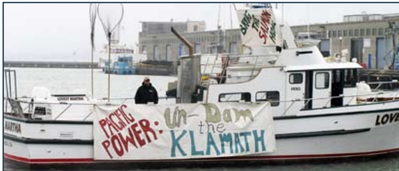
Commercial fishermen rally for Klamath dam removal on San Francisco Bay after the salmon season was closed coastwide due to the Klamath's poor Chinook returns in 2006.

A final dam removal deal is due this fall that will fold the Klamath Basin Restoration Agreement (KBRA) and the draft Agreement in Principle (AIP) into one final package of agreements that will remove the dams. In order for this final deal to set the stage for true progress on the Klamath, it must improve conditions for fish, people, and wildlife. To that end, KRK has developed the points below. If these issues are adequately addressed in the final deal, it can win our support. If not, KRK is prepared to take legal action to ensure the deal truly serves the Klamath.