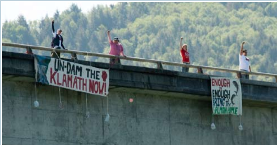
Early this summer, Klamath Justice Coalition activists hung banners from Hwy 101's Golden Bears Bridge over the Klamath River. The signs sent a message to dam removal negotiators touring the lower river by boat below the bridge: Un-Dam the Klamath Now! Enough is Enough, Bring the Salmon Home.