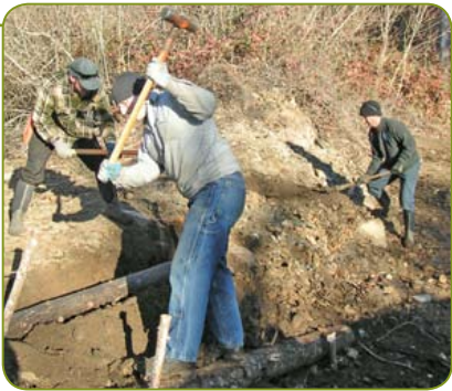
Lomakatsi Restoration Project